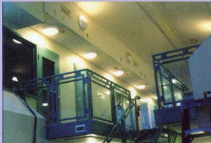
MAPLE LANE JUVENILE CENTER CENTRALIA, WA