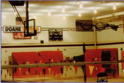
DOANE COLLEGE CRETE, NE